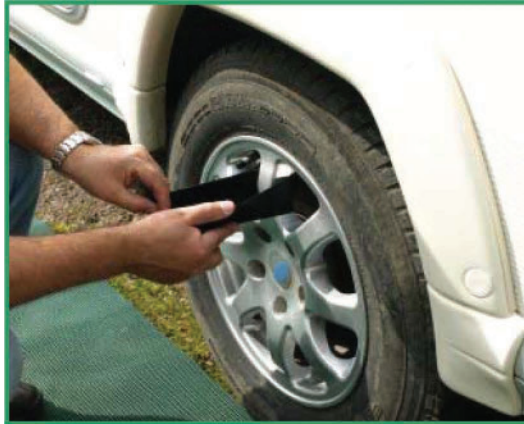
2. Hold the Velcro strap around the highest spoke in the wheel