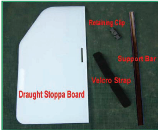
1. Component parts