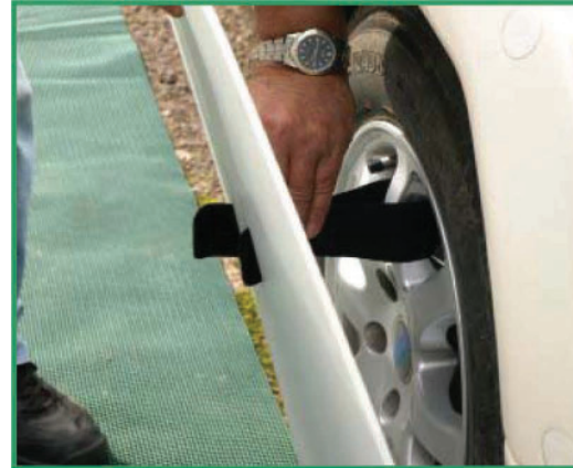
3. Position the board with the fold away from the vehicle body, locate the strap through the slots