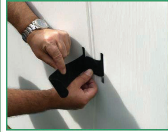
4. Secure the strap so as to flatten the fold and leave the board flush against the vehicle body