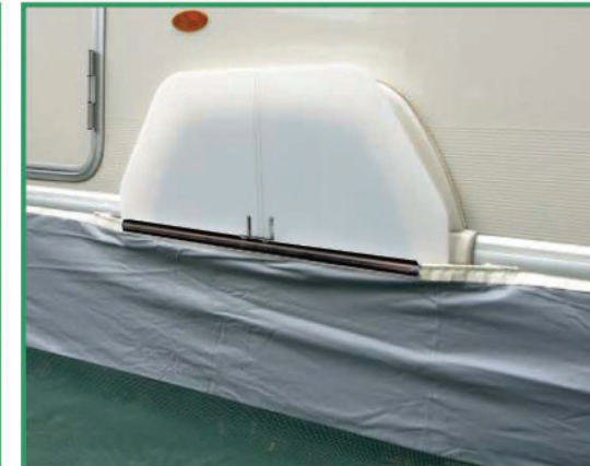
8. Installation complete, removal is a reversal of these fitting instructions

NOTE - Due to the variation in caravan geometry, it may be necessary to trim excess board to attain a correct fit