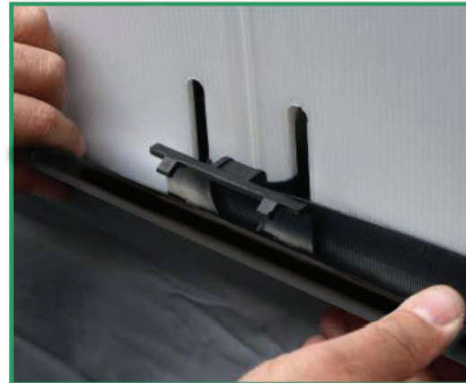
7. Clip the support bar in to the retaining clip by first locating the bottom lip of the bar