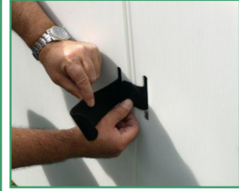
4. Secure the straps so as to flatten the folds and leave the board flush against the vehicle body