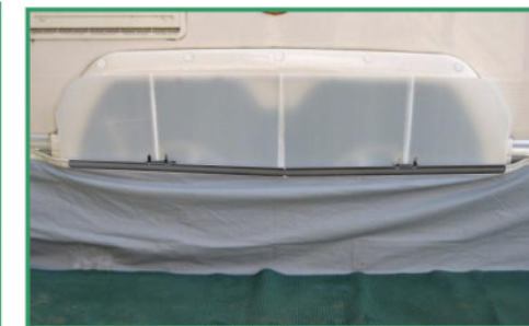
8. Installation complete, removal is a reversal of these fitting instructions

NOTE - Due to the variation in twin axle geometry, it may be necessary to trim excess board to attain a correct fit