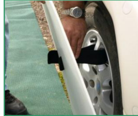
3. Position the board centrally so the straps can be located through the slots that align best