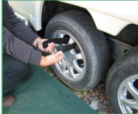
2. Hold the Velcro strap around the highest spoke in the wheel