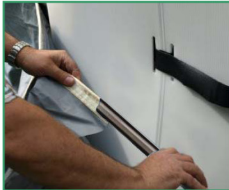
5. Thread the support bar on to the skirt